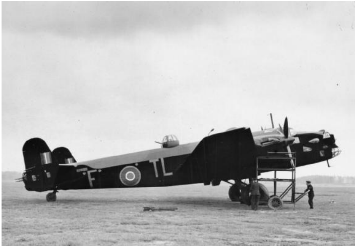
Halifax W7699

W7699 failed to return and the squadron's Operations Record Book shows "Took off from Linton for Essen; No news of this aircraft was received after it left base".